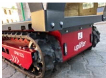
Extendable struts on both sides to extend the loading platform.